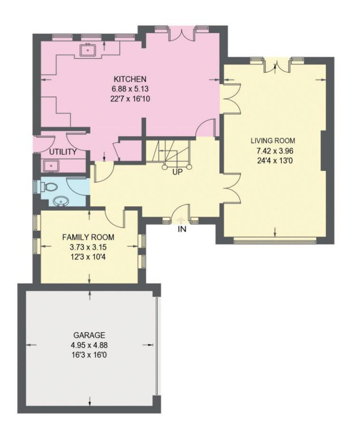
GROUND FLOOR (EXCLUDING GARAGE) 94.6 SQ M / 1018 SQ FT

APPROXIMATE GROSS INTERNAL AREA = 260.1 SQ M / 2799 SQ FT GARAGE = 24.2 SQ M / 260 SQ FT TOTAL = 284.3 SQ M / 3059 SQ FT (EXCLUDING EAVES)