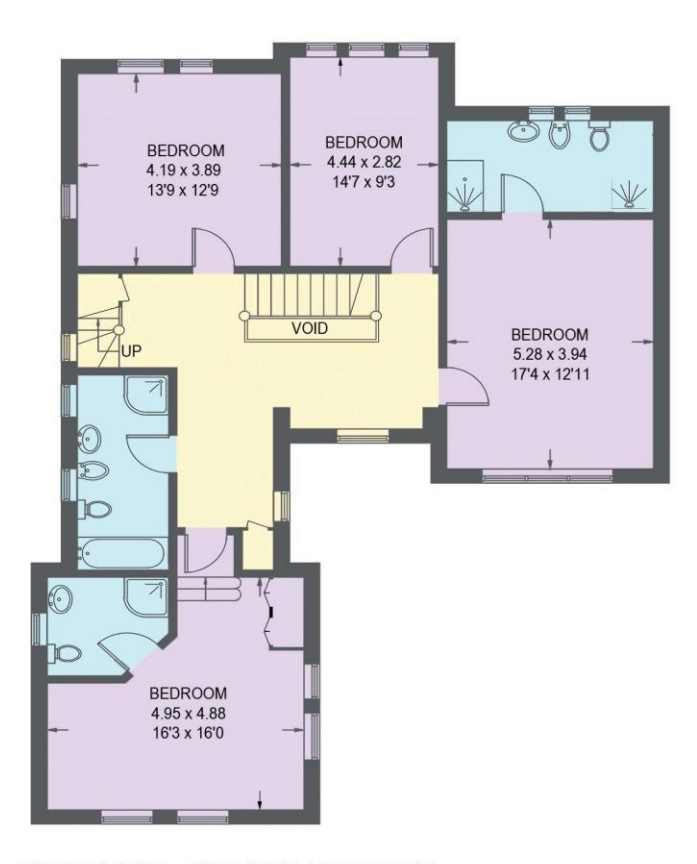
FIRST FLOOR = 119.3 SQ M / 1284 SQ FT